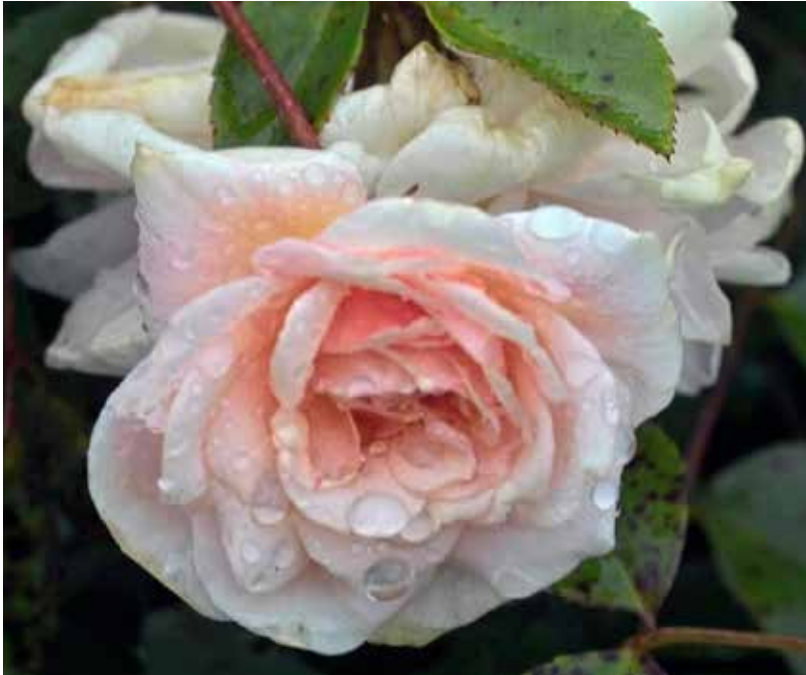
'Mlle Cecile Brunner'

of which he was particularly fond; on the other hand, Graham Thomas found it ordinary and vulgar. Judge for yourself.