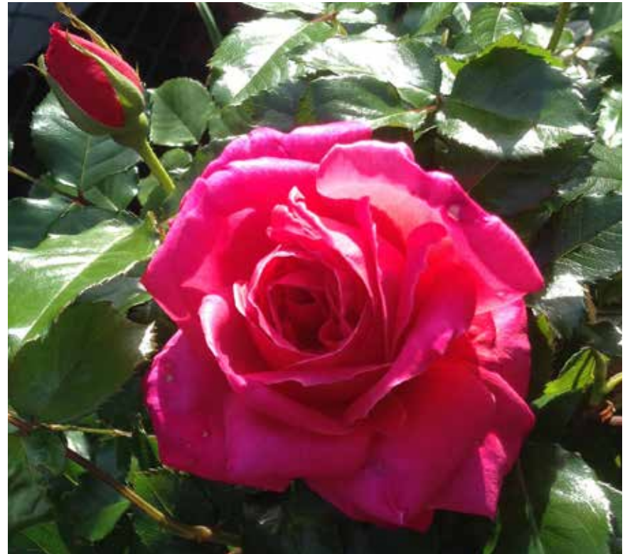
‘Violinista Costa’