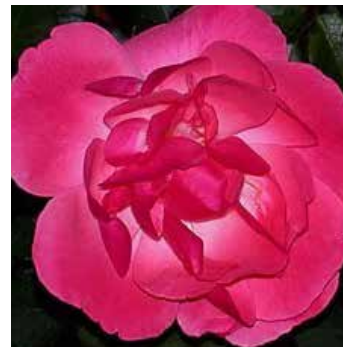
top to bottom: Tea bouquet from the collection—no two alike; 'Ibiza' from the Vintage Hybrid Tea collection; 'Kathleen Ferrier' in the Vintage Floribunda collection