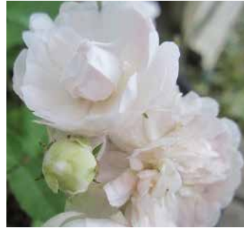
A Lazy Time

You may well wonder what is happening with The Friends of Vintage Roses, as it appears on the surface that we are simply 'giving away' the roses that are our mission to preserve. . . . see page 8