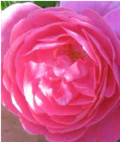
top: 'Ile de France' from the Vintage Rambler collection; above: 'Marchioness of Lorne' in the Vintage Hybrid Perpetual collection

maintaining more than 4000 roses in pots, along with the two thousand that grow in the garden, has simply strained our resources and our volunteer force beyond our abilities. We must reduce this burden or face losing all.