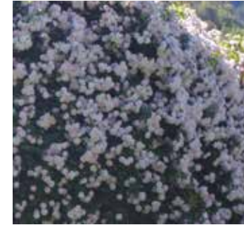
Paul's Himalayan Musk Rambler

In 1880–81, the advent of French new roses were so many one could barely keep abreast. Louis Levêque alone turned out so many Hybrid Perpetuals each year that one wondered at their quality. . . . see page xx