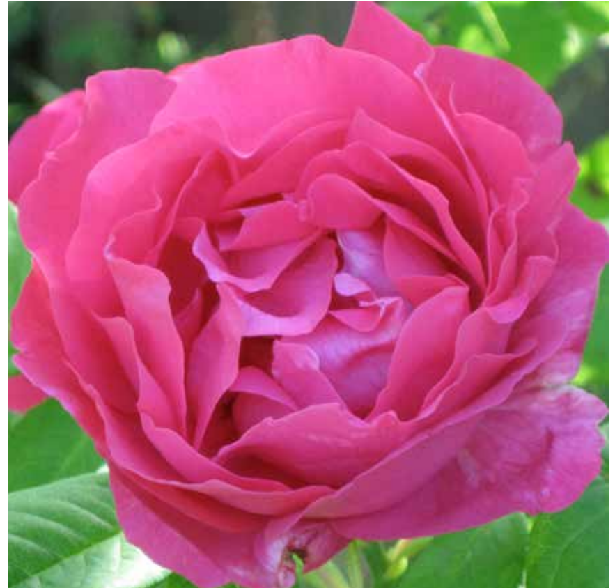
'Ulrich Brunner fils'

Although one respected source states the namesake for this rose was the daughter of Emperor Franz-Josef, the emperor had no daughter by that name; her father was Archduke Joseph (an easy mistake to make), Palatine of Hungary, which made her a princess of Hungary. (She was also princess of Bohemia). Archduke Joseph is not, however, the same as Archiduc Joseph for whom a popular Tea rose is named. The problem in the history here is the frequent recurrence of names. In fact, there were three archduchesses named Elizabeth, not counting the Empress of Austria's title before her reign. This rose seems to have been named for Archduchess Elisabeth Franziska, born in 1831, who married Archduke Ferdinand Karl Viktor of Austria-Este in 1847, with whom she had one daughter. After his death, she married her first cousin in 1854,