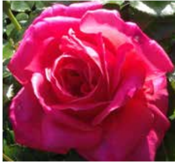
'Violinista Costa' (featured rose)

That Carlos Camprubi should have been breeding and bringing out roses during that chaotic and dangerous time . . . makes me feel tender and protective toward this beautiful, wartime rose. . . . see page 4