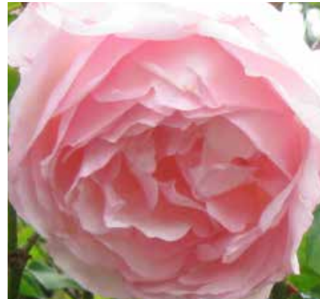
‘Duchesse de Brabant’

Meanwhile Virginia and I were collecting cuttings of abandoned roses from roadsides, vacant home sites, Rose Memorial Cemetery in Fort Bragg, and Hillcrest Cemetery in Mendocino. From Rose