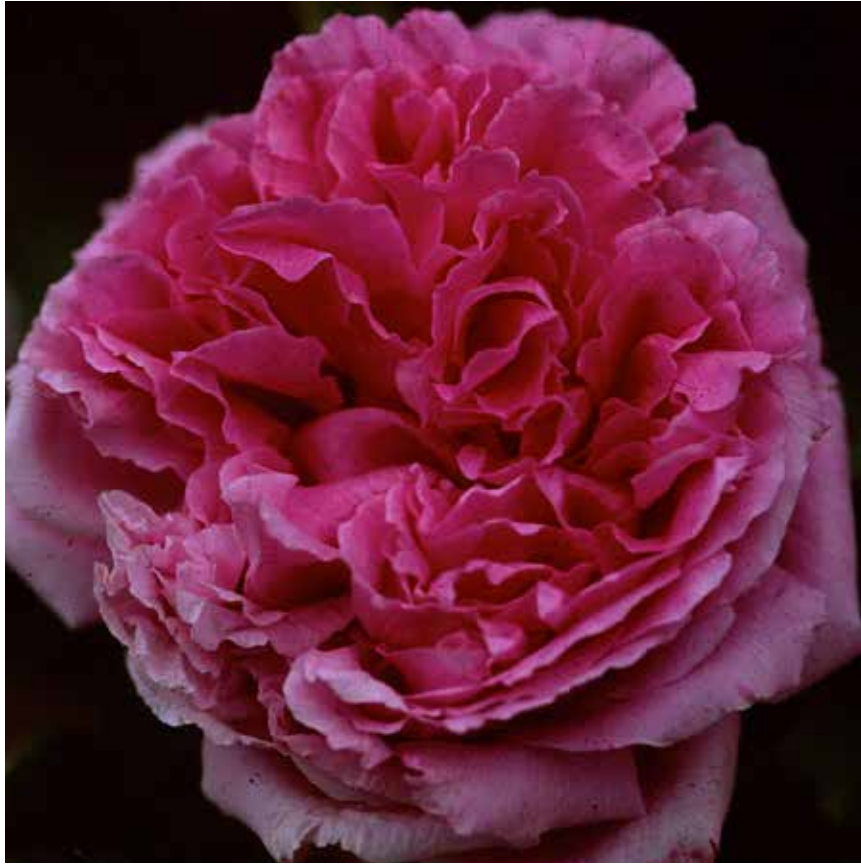
'Archiduchesse Elizabeth d'Autriche'